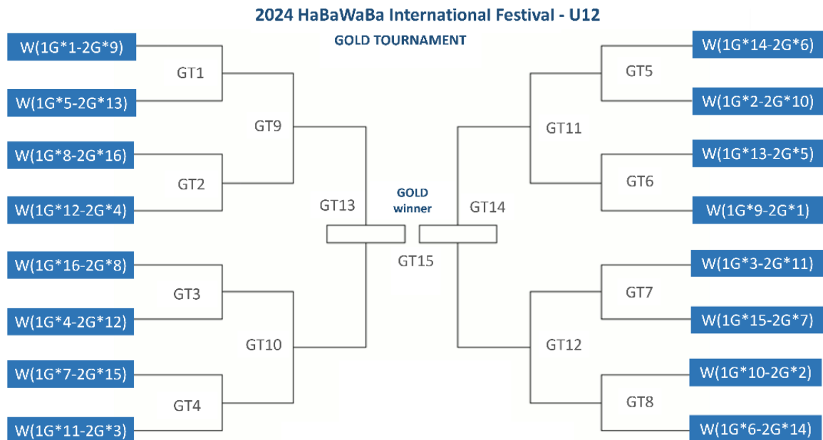
Table 1: U12 GOLD Tournament

At the end of Phase B1, the teams classified 1st and 2nd in groups G1* to G16* enter the round of 32 of the Gold tournament (32 teams) as per the following scheme.