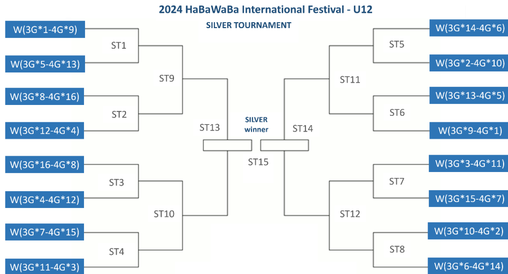
Table 2: U12 SILVER Tournament

At the end of Phase B1, the teams classified 3rd and 4th in groups G1* to G16* advance to the round of 32 of the Silver Tournament (32 teams) as per the following scheme.